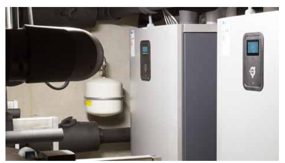
Thermia Mega - inverter-driven ground source heat pumps

The Thermia Mega solution not only provides high volumes of heat and hot water. It also adds to the value of the newly built property,