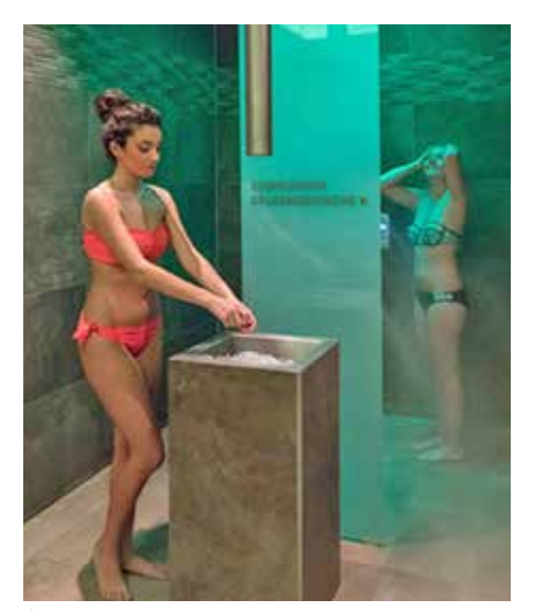
Shower and ice generator in sauna

a heating capacity of 14-59 kW. Ground water with a temperature of around 10°C is the energy source for the heat pump. The heating system covers floor heating as well as pool and floatation pool heating.